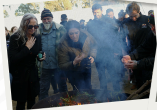
Image: Smoking Ceremony