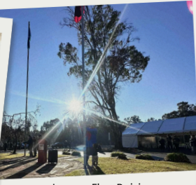
Image: Flag Raising