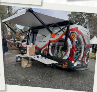
Image: Our Medical Van