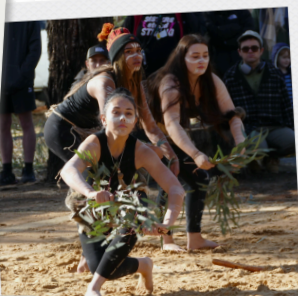
Image: Welcome Ceremony