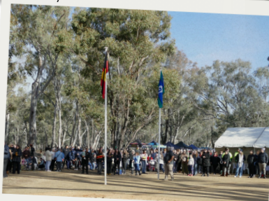
Image: Flag Raising

CONGRATULATIONS TO YORTA YORTA NATIONS ON ANOTHER SUCCESSFUL DHARYNA DAY