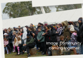
Image: Community coming together