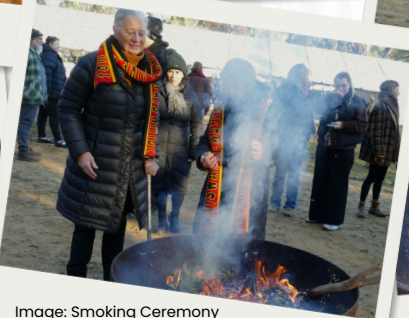
Image: Smoking Ceremony