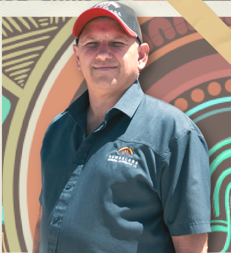
SERVICE DELIVERY MANAGER

With the support from the Executive team and the CEO, this role has allowed me to grow within myself, and within the organisation.